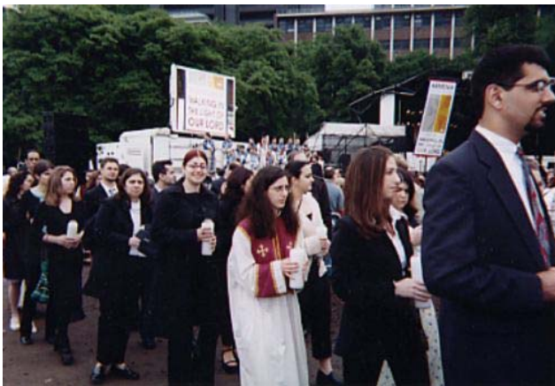
The Flame of St. Gregory is carried into Central Park by Armenian Youth from throughout the Diocese.

lowed, with the Watertown, MA chapter winning the Overall Trophy. Along with social events planned throughout the weekend, Armenian youth from all over the United States and Canada came