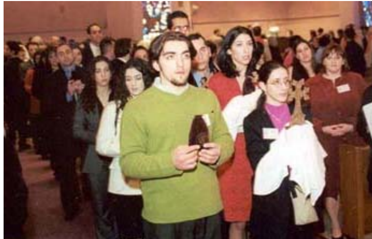
Youth representatives from throughout the Diocese receiving Holy Muron and wooden crosses during Armenian Christmas services on January 6.