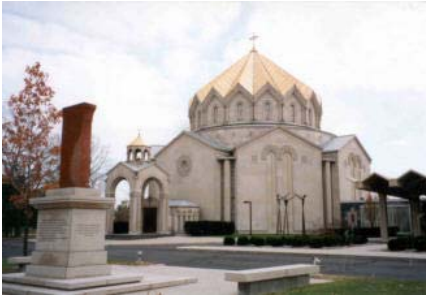
Our newly elected board St. John's Armenian Church in Detroit.

The Detroit ACYOA Seniors of St. John Armenian Church are on their way to another successful year. Thanksgiving weekend we hosted the fifty-fifth annual November Dance. Over 400 young adults danced to the tunes of The Philly Kef Band and American DJ. Just one month later, our ACYOA Juniors and Seniors sponsored our annual Christmas Eve Tea, as a way to help bring parishioners closer together during the holiday season. Continuing with the spirit of giving, we also hosted a blood drive for The American Red Cross the day after Christmas. Together, we helped to save possibly forty-five or more lives.