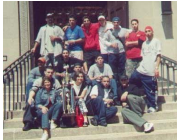
Our 2002 Hosts, the Watertown Chapter, at the steps of the Diocesan Plaza with their Overall Trophy.